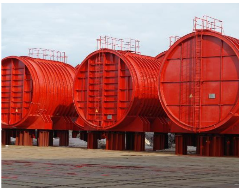
1-compartment RC units at a long-term storage site