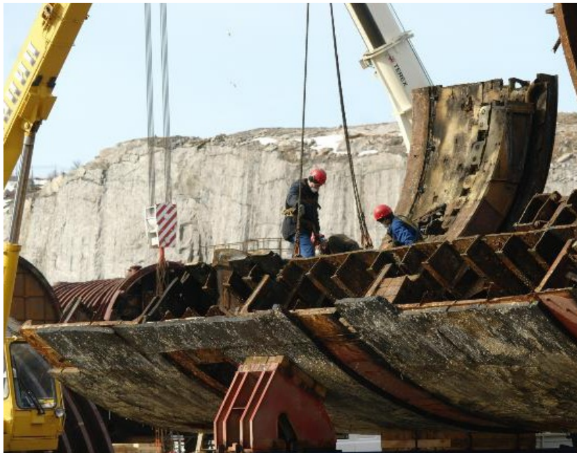
3-compartment unit processing stages. Shaping of a 1-compartment unit