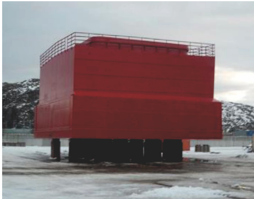
NMV block package