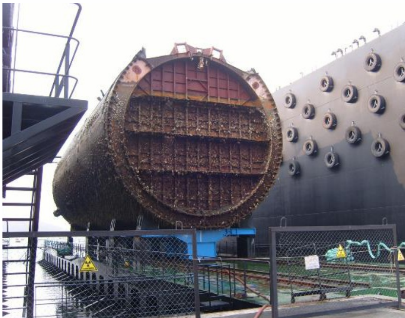
Dock with a 3-compartment unit near the pier wall